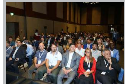
A view of conference