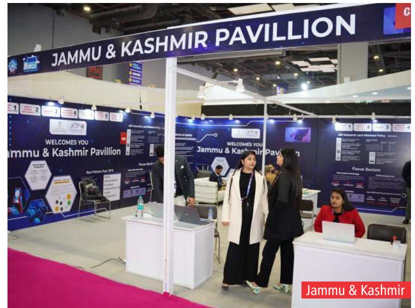
Jammu & Kashmir