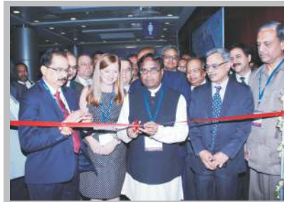
INDIASOFT 2012 being inaugurated by Mr. Ponala Lakshmaiah, Hon'ble IT Minister, Govt. of Andhra Pradesh and Guest of Honour, Ms. Anabel Gonzales, Hon'ble Foreign Trade Minister, Republic of Costa Rica