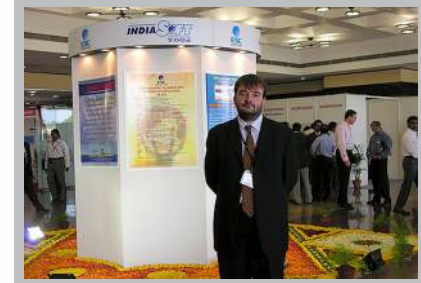
A view of INDIASOFT 2006.