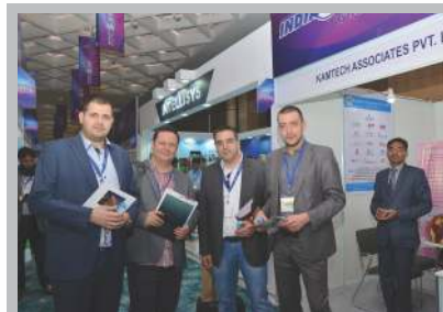
A view of exhibition area of INDIASOFT 2015