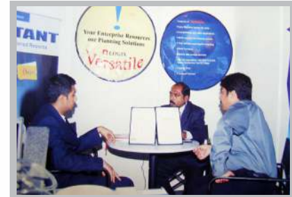
B2B meets at INDIASOFT 2008.