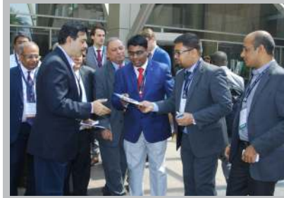
A view of INDIASOFT 2017