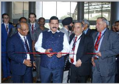
Mr. Y S Chowdary, Hon'ble Union Minister of State for Science & Technology and Earth Sciences, Government of India inaugurating the INDIASOFT 2017.