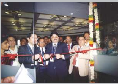
Mr. Dayanidhi Maran, Hon'ble Minister for Communications and IT, inaugurating the INDIASOFT 2005 exhibition.