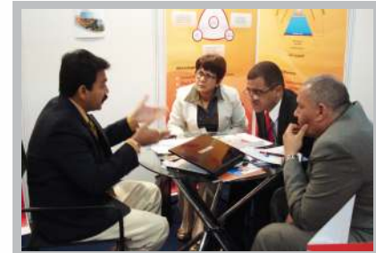
Foreign delegate interacting with Indian participants.