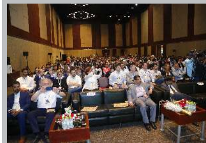
A conference view during INDIASOFT 2019 exhibition.