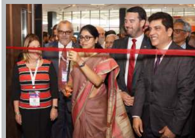
Ms. Anupriya Patel, Union Minister of State for Commerce & Industry inaugurated the 23rd edition of INDIASOFT