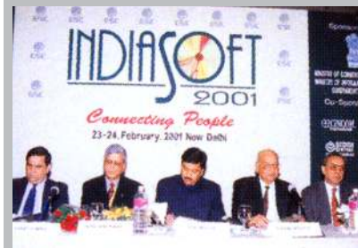
Mr. Pramod Mahajan, Hon'ble Union Minister for Communications & Information Technology at INDIASOFT 2001