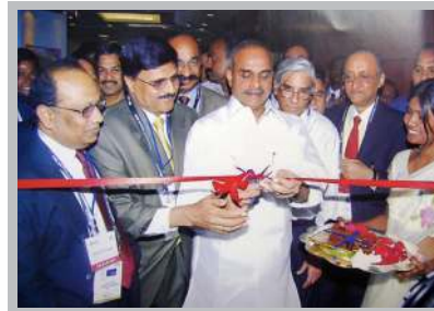
Mr. Y.S. Rajshekhara Reddy, Hon'ble Chief Minister of Andhra Pradesh, inaugurating the INDIASOFT 2008 exhibition.