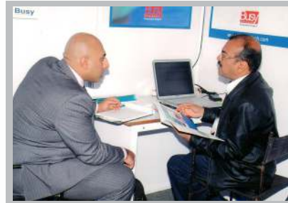
B2B meets at INDIASOFT 2007.