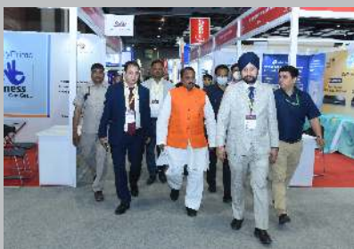
Mr. Bhanu Pratap Singh Verma, Hon'ble Minister of State for MSME, Government of India visiting the exhibition area.