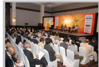
A view of conference at INDIASOFT 2014