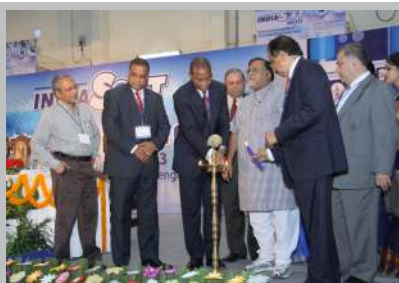
Mr. Partha Chatterjee, Hon'ble Minister of IT, Govt. of West Bengal inaugurating INDIASOFT 2013 along with Mr. Tassarajen Pillar Chedumbrum, Hon'ble Minister of IT, Mauritius and Mr. Bruno Nabagne Kone Hon'ble ICT Minister, Cote D' Ivoire.