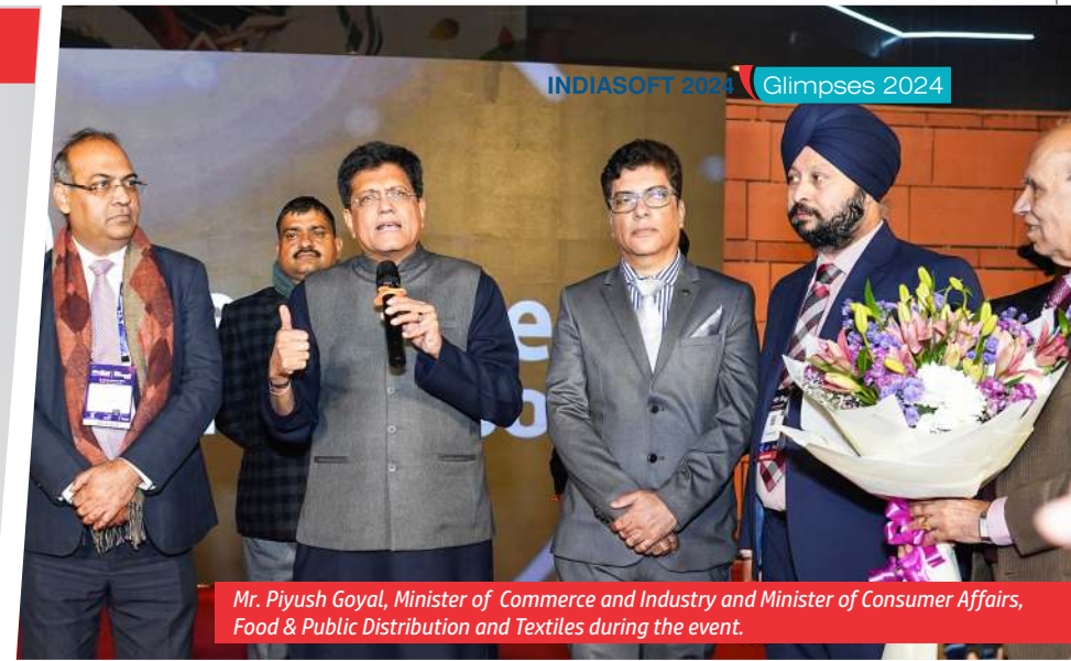
Mr. Piyush Goyal, Minister of Commerce and Industry and Minister of Consumer Affairs, Food & Public Distribution and Textiles during the event.