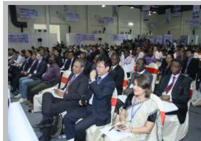
A conference view of INDIASOFT 2013 exhibition.