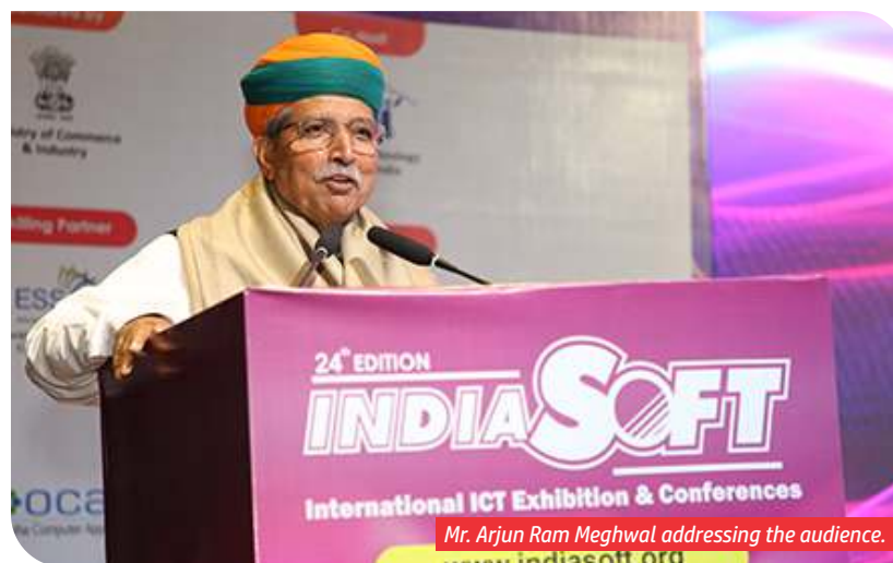
Mr. Arjun Ram Meghwal addressing the audience.

Further, he highlighted that every segment of the Indian economy was moving towards digitization in all avenues including the domain of legal affairs, transforming the country into a digital behemoth; he added that the process would continue unabated and would transform boundaries into opportunities.