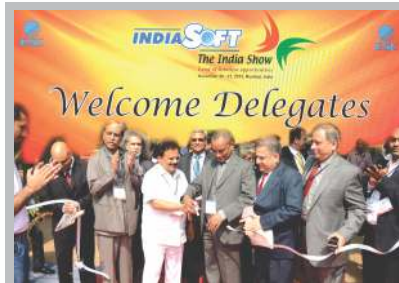
Dr. E.M.S. Natchiappan, Hon'ble Minister of State for Commerce & Industry, Department of Industrial Policy and Promotion, Government of India inaugurating INDIASOFT 2014 along with H.E. Dr. Debretsiion Gebre Michael, Deputy Prime Minister, Ethiopia.