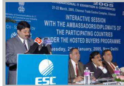
Mr. Dayanidhi Maran, Hon'ble Minister for Communications and IT, addressing the audience.