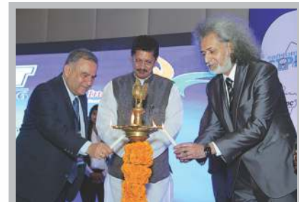
Hon'ble Minister for Finance, Planning and Rural Development, Govt. of Maharashtra lighting the lamp during INDIASOFT 2016