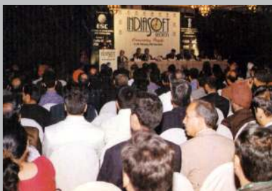
Inaugural edition of INDIASOFT in the year 2001