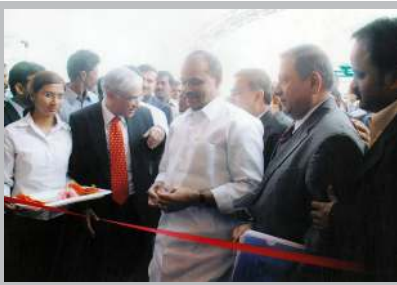
Mr. Y.S. Rajshekhara Reddy, Hon'ble Chief Minister of Andhra Pradesh, inaugurating the INDIASOFT 2007 exhibition.