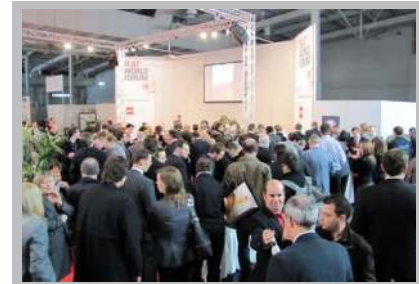
A view of gathering during INDIASOFT 2012