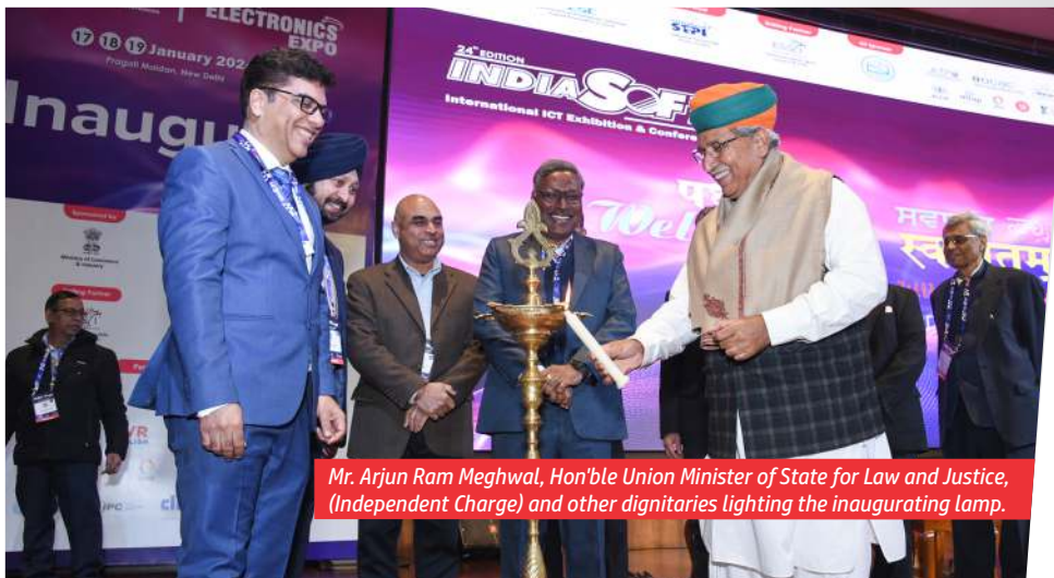
Mr. Arjun Ram Meghwal, Hon'ble Union Minister of State for Law and Justice, (Independent Charge) and other dignitaries lighting the inaugurating lamp.

The Electronics and Computer Software Export Promotion Council (ESC) organised the 24th edition of its flagship event – INDIASOFT 2024 during 17th-19th January 2024 at New Delhi. The event was graced by the presence of Mr. Piyush Goyal, Hon'ble Minister of Commerce and Industry and Minister of Consumer Affairs, Food & Public Distribution and Textiles, Mr. Arjun Meghwal, Hon'ble Minister of State for Law and Justice (Independent Charge) and Ms. Meenakshi Lekhi, Hon'ble Minister of State for External Affairs, Government of India. Deputy Minister of Communications, Cuba Eng. Wilfredo Gonzalez Vidal was the Guest of Honour.