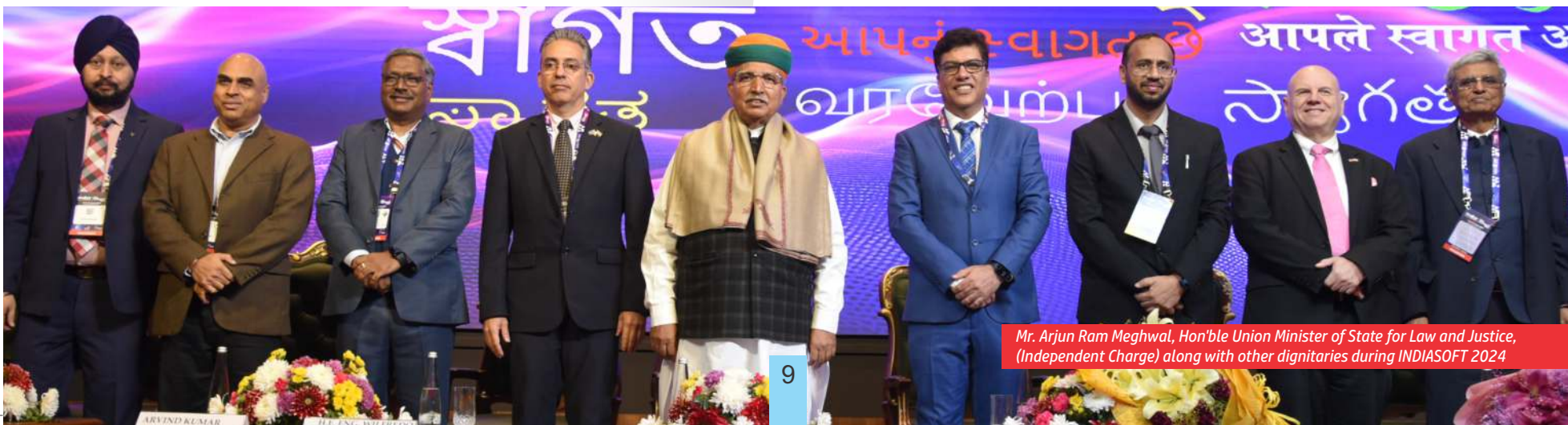
Mr. Arjun Ram Meghwal, Hon'ble Union Minister of State for Law and Justice, (Independent Charge) along with other dignitaries during INDIASOFT 2024