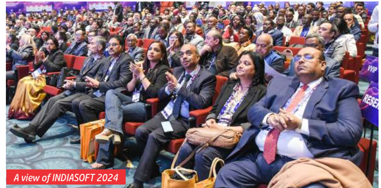
A view of INDIASOFT 2024