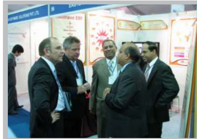
Participants interacting at INDIASOFT 2011 exhibition.