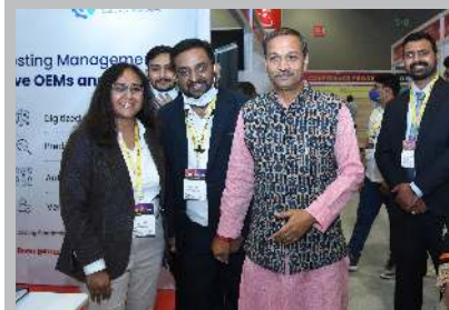
Mr. Om Prakash Saklecha, Hon'ble Minister for MSME and Science & Technology, Govt. of Madhya Pradesh at the exhibition area.