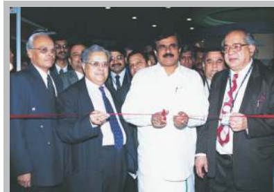
Su. Thirunavukkarasar, Hon'ble Minister of State for Communications and IT, Govt. of India inaugurating INDIASOFT 2004 exhibition.