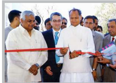
Mr. Ashok Gehlot, Hon'ble Chief Minister of Rajasthan, inaugurating the INDIASOFT 2010 exhibition.