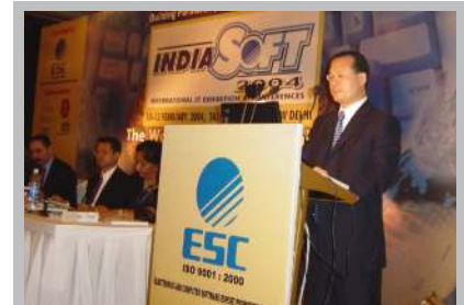
During INDIASOFT 2004 exhibition.