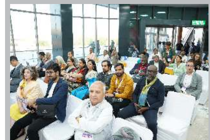
Participants during INDIASOFT 2023 exhibition.